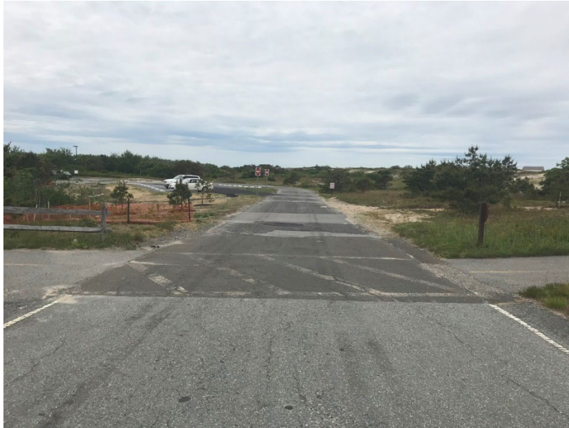
Figure 51: Road Approach (Note the Faded Intersection and Lack of Signage)