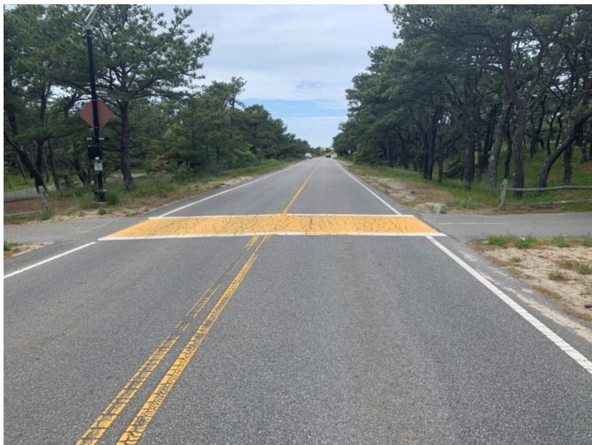
Figure 55: Road Approach