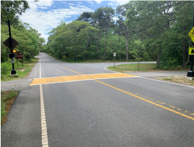
Figure 57: Road Approach (Note the RRFBs) and Painted Crosswalk