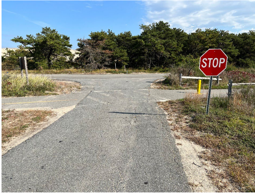
Figure 53: Road Approach (Facing East Towards Race Point Road)