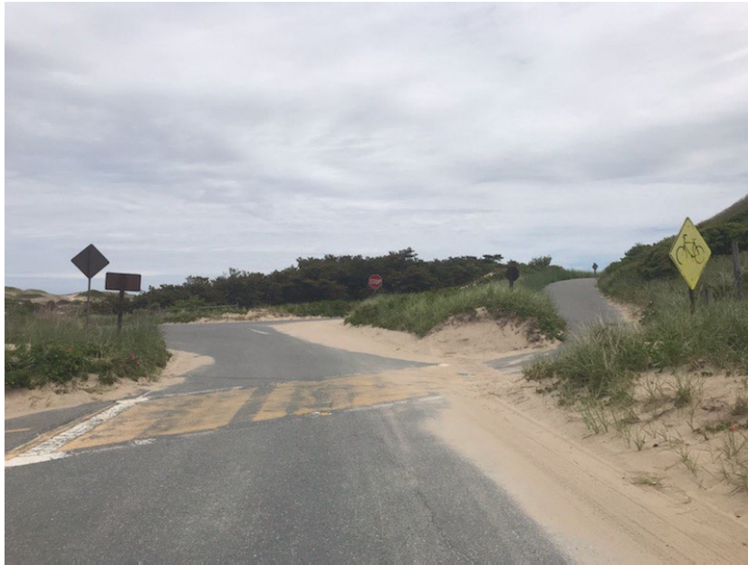
Figure 49: Road Approach (Intersection partially Covered in Sand)