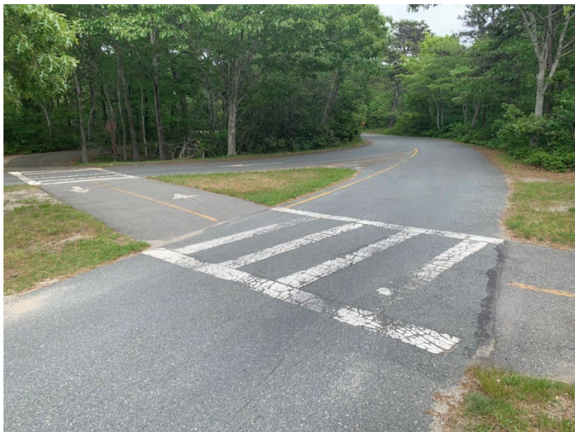
Figure 59: Road Approach (Note the 2-Stage Crossing).